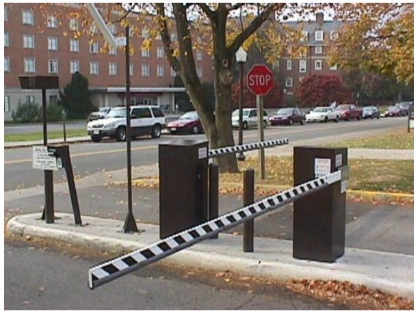
Figure 1. A simple parking gate is a potential target for a security attack.

secure networks. The rating system includes various measures describing characteristics such as: out-of-box susceptibility, ease of maintaining the level of security, and expertise required for security initiation and maintenance. A date is associated with a rating indicating the relative validity of the evaluation.